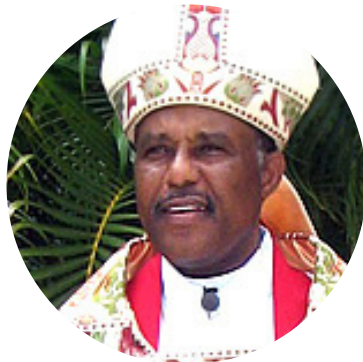
The Right Reverend Victor Edward Ambrose Gumbs Bishop Episcopal Diocese of the Virgin Islands