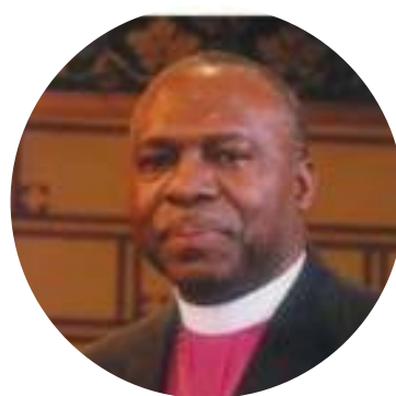
The Right Reverend Victor Scantlebury Former Acting Bishop Episcopal Diocese of Central Ecuador